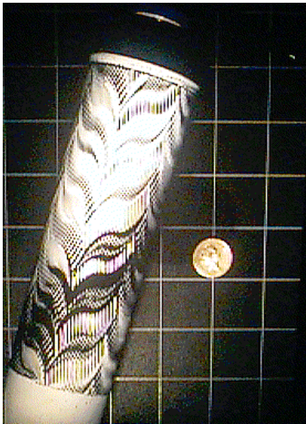
Wrapped around a spray can

Having enlarged the pattern to fit any suitable handy object of a similar shape to the design, in this case a can of photo-mount spray, cut out and wrap your image around the object.