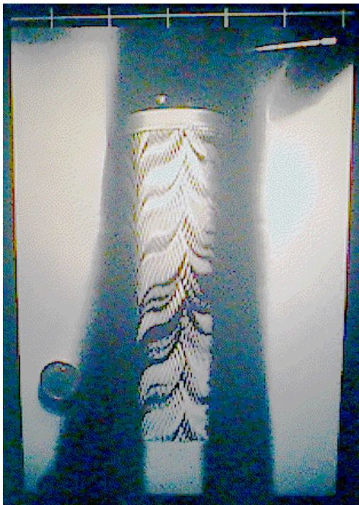
A copy from the wrapped can

Having enlarged the pattern to fit any suitable handy object of a similar shape to the design, in this case a can of photo-mount spray, cut out and wrap your image around the object.