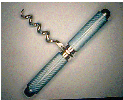
A silver corkscrew, recessed around the tube and enamelled over a spiral pattern

Modern manufacturers can take significant advantage of combining engine turning with colour to produce large ranges of goods from only a small number of different components, imaginatively mixed together. This can work particularly well for things such as writing instruments and other items, particularly with limited editions.