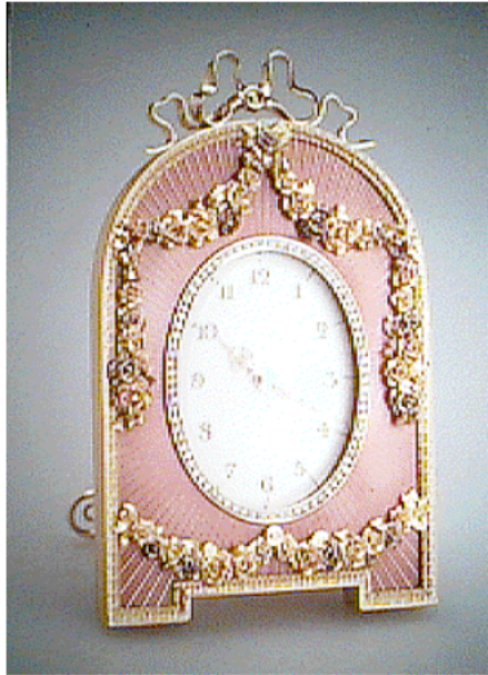
A frame style clock in 18ct gold, engine turned in a sunray lines and spaces design, with four-colour gold mounts

Frames and clocks of this type provide an economical way to create a large range of products with minimal investment by using the "mix-n-match" principle.