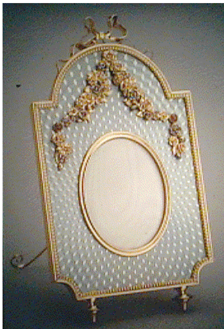
An enamelled Photo Frame, engine turned sunray basket with four-colour gold mounts

By combining these variations, literally hundreds of different frames were mass produced and sold as individually made items never to be repeated by the Fabergé company. Not surprisingly, the combination of taste, style and price made the company a resounding success, employing around 750 people in its heyday, many of whom worked in a large factory at St Peterburg.